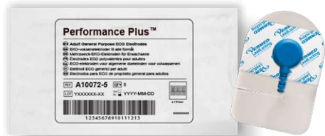
Foam | Wet Gel A10072